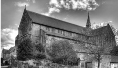
St. Patrick at Felling