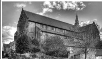
St. Patrick at Felling