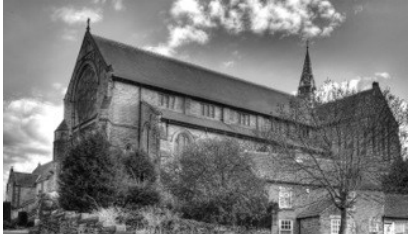
St. Patrick at Felling