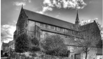
St. Patrick at Felling