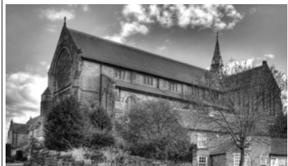
St. Patrick at Felling