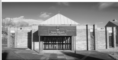
St. Alban at Pelaw