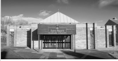
St. Alban at Pelaw