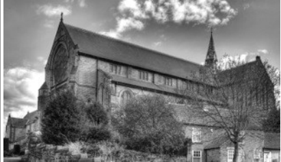
St. Patrick at Felling